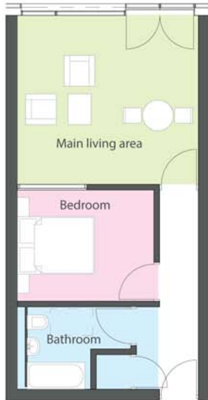
Typical one bedroom unit 447 2 ft